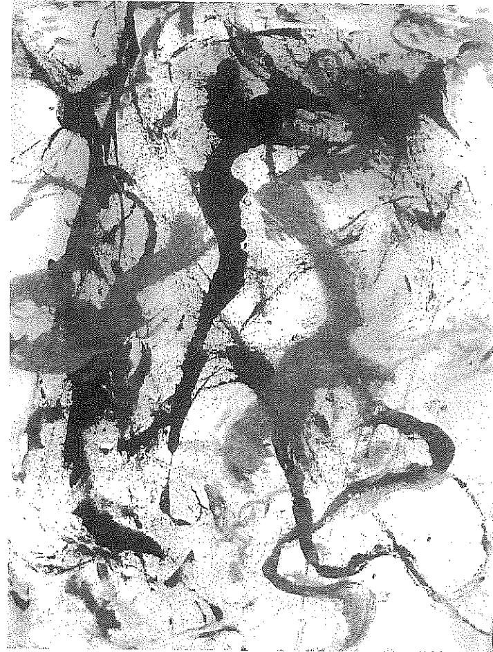
19. This painting in blues and greens was made by a snake being treated by the University of Illinois Veterinary Teaching Hospital Wildlife Clinic, Champaign, and was used to raise money for the operation of the nonprofit facility. Note the sinewy traces of the snake's body and movement inscribed on the canvas board. Water-based, nontoxic paints on canvas board, 9 \times 12 ". Collection of the author.