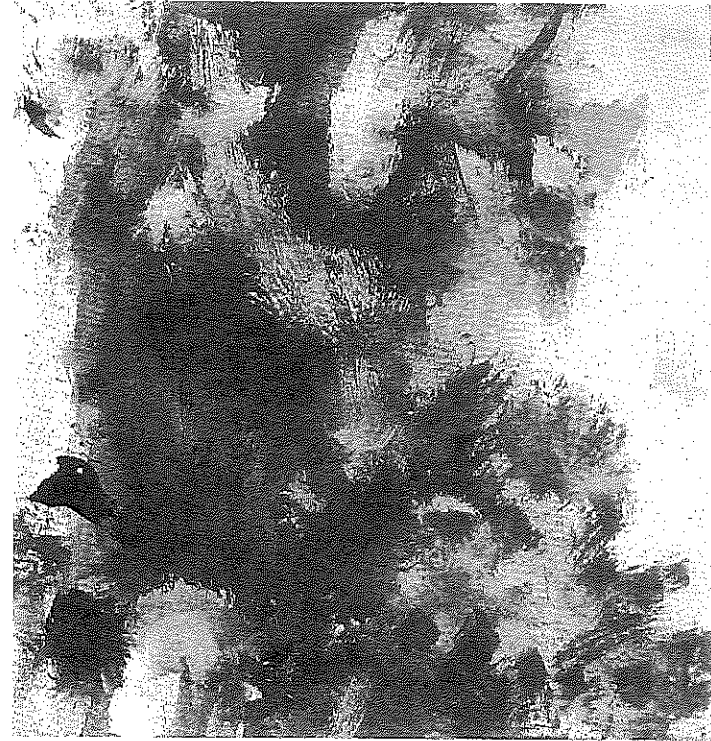
25. This painting, Stink Gorilla More by Michael the gorilla, then in residence at the Gorilla Foundation, Woodside, California, used nontoxic paints to depict a plenitude of multicolored flowers in pastel colors. According to the Gorilla Foundation, the word stink in the title of this painting, supplied by Michael, refers to the gorilla's word for "flower," referencing its intense smell. Michael, now deceased, produced many paintings, like his companion Koko, and both titled their paintings in their own words, which were then interpreted by their caretakers.