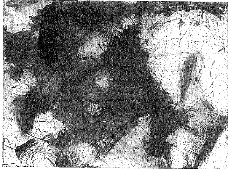
21. Painting by Midge the sea lion, Oklahoma City Zoo and Botanical Garden, produced September 6, 2007. Water-based paints on canvas board, 8 × 12". Collection of the author.