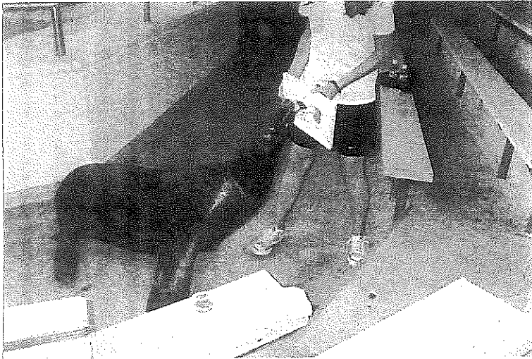
20. Midge the sea lion paints with one of her zookeepers poolside on September 6, 2007, at the Oklahoma City Zoo and Botanical Garden. Holding a modified brush in her mouth, she shakes her head vigorously back and forth, making swift bright-blue and purple strokes on an eight-by-twelve-inch canvas board.