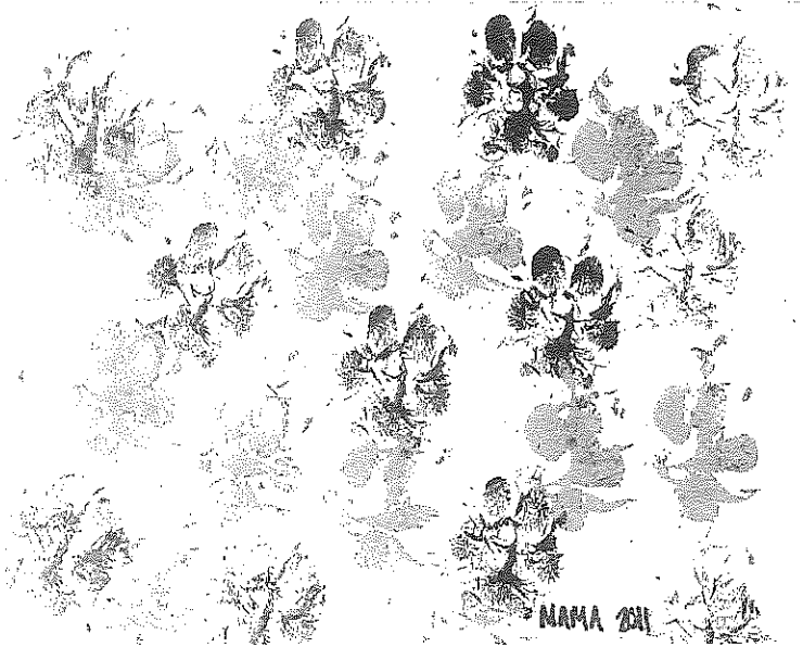
18. Mama the wire-haired fox terrier made this painting at a Champaign County (Illinois) Humane Society fund-raising event in 2011. Note the imprint of her paw pads, marking the physical trace of the individual animal, as distinctive as a human fingerprint. Water-based paints on paper, 8\frac{1}{2} \times 11 ". Collection of the author.