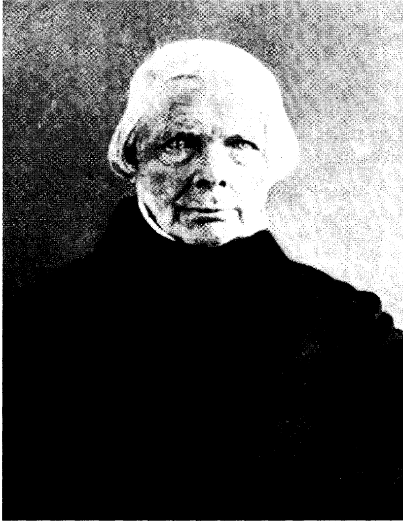
The Philosopher Schelling, ca. 1850.