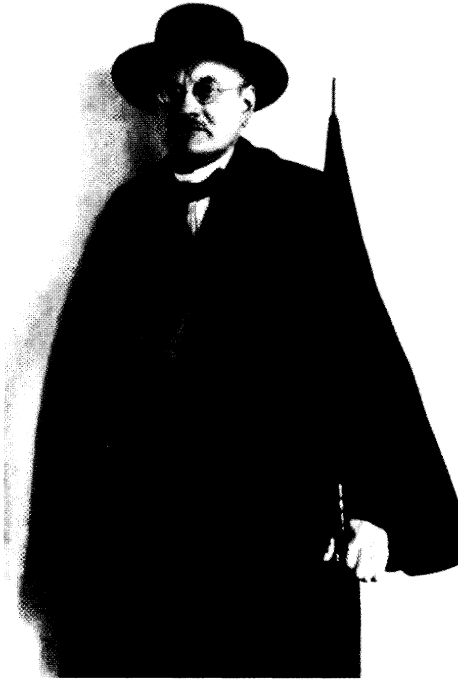
Parliamentary Representative (a Democrat).