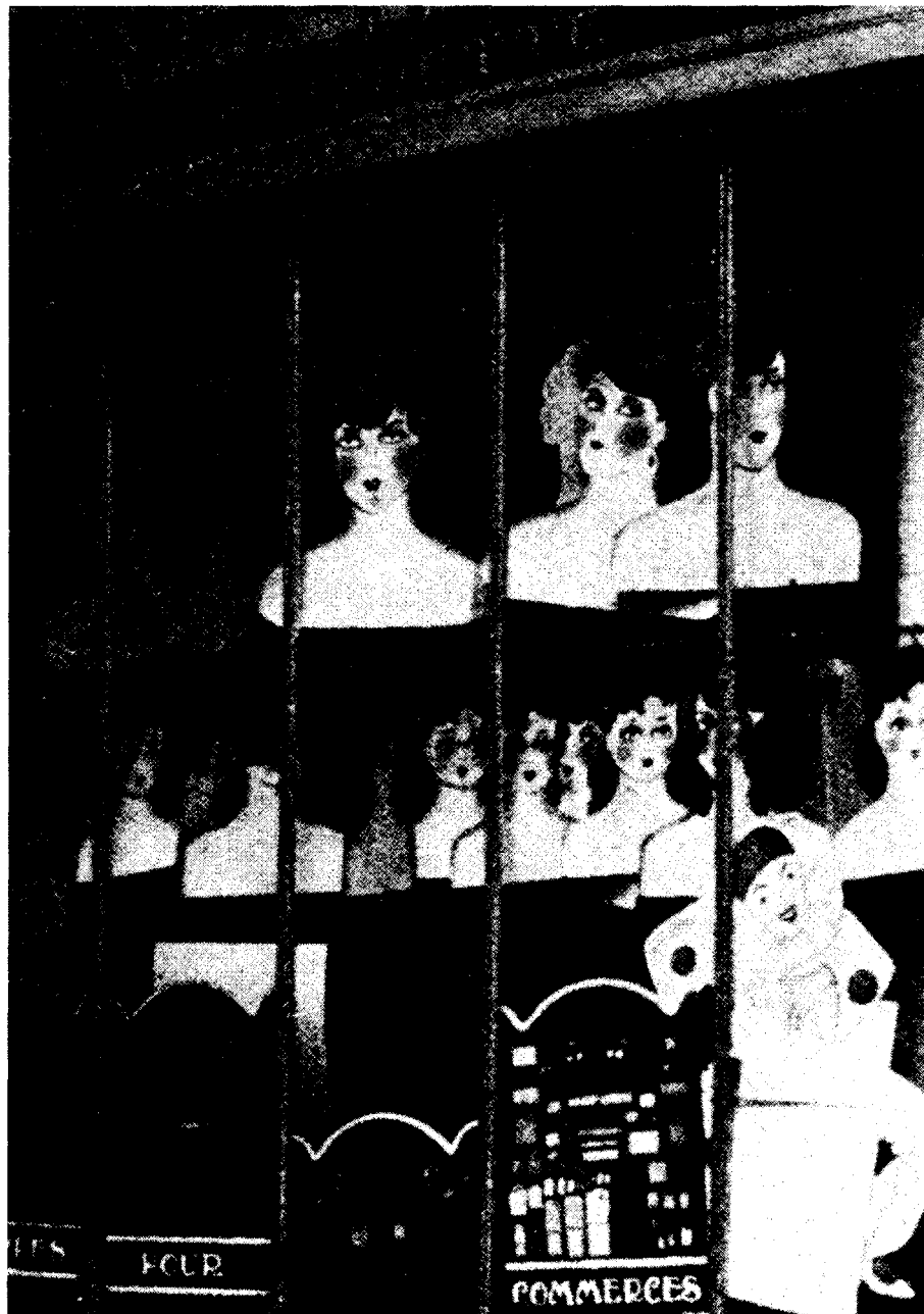
Display Window.