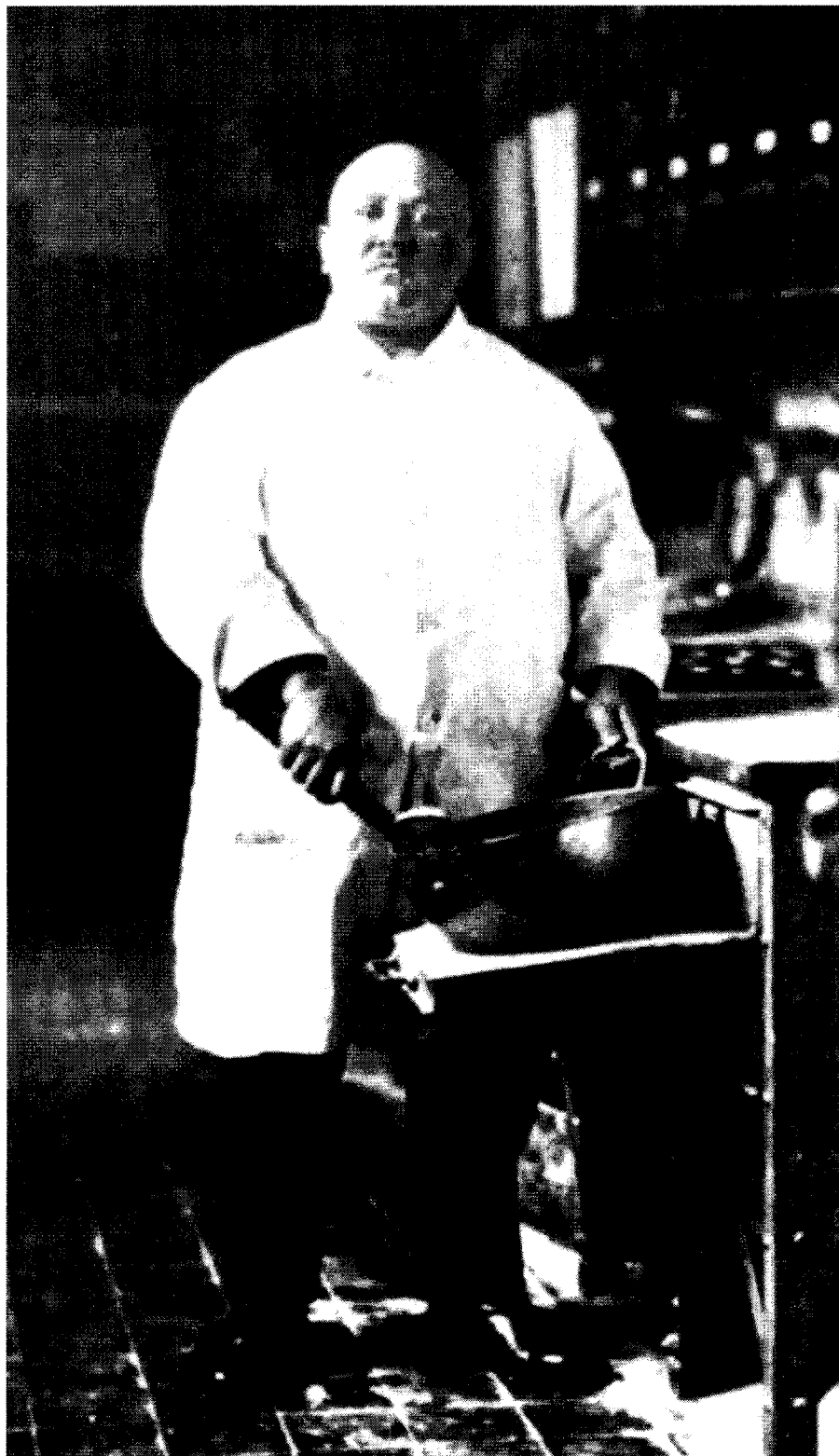
Pastry Cook.