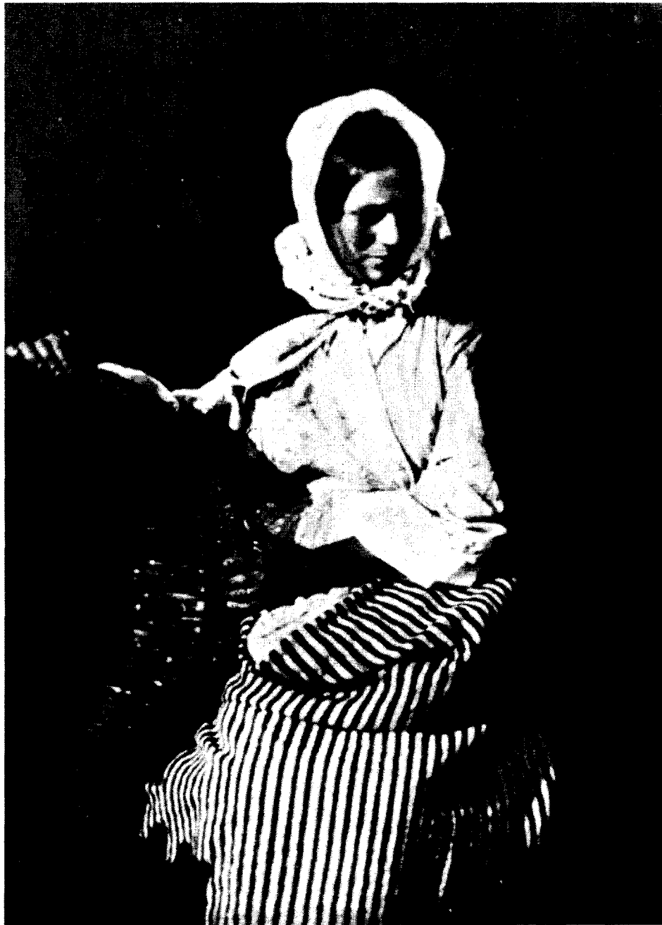
Newhaven Fishwife.